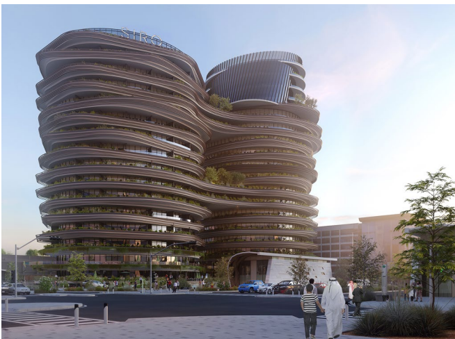
SIRO Olaya Riyadh (render)

For more information contact: f.begaj@mondiale.co.uk www.thesetawards.com