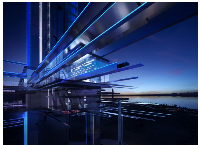
Epicon Hotel, NEOM (render)