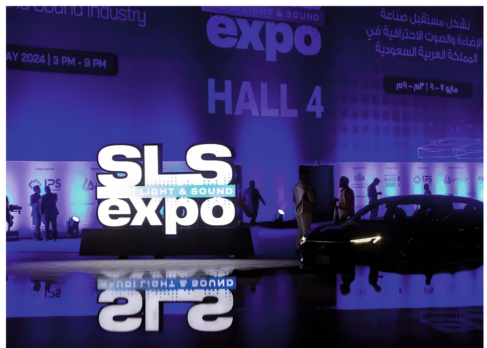
SLS Expo, RFECC

The meticulously crafted event ensures that every aspect finds its place, offering you the chance to forge valuable connections and elevate your business to unprecedented levels. Immerse yourself in the world of professional light and sound, leaving your indelible mark on the industry.