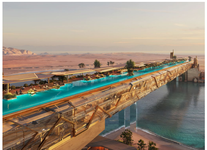
Trayam, NEOM (render)