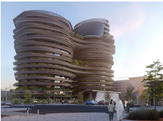
SIRO Olaya Riyadh (render)

For more information contact: f.begaj@mondiale.co.uk www.thesetawards.com