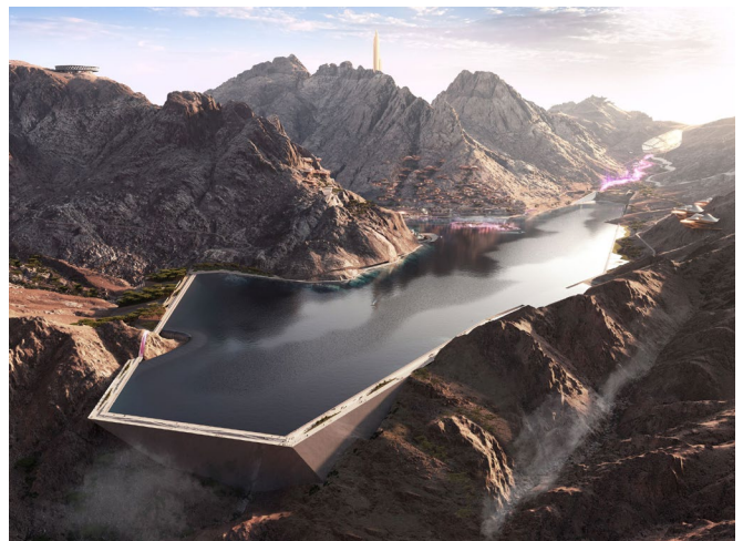
Trojena, NEOM (render)