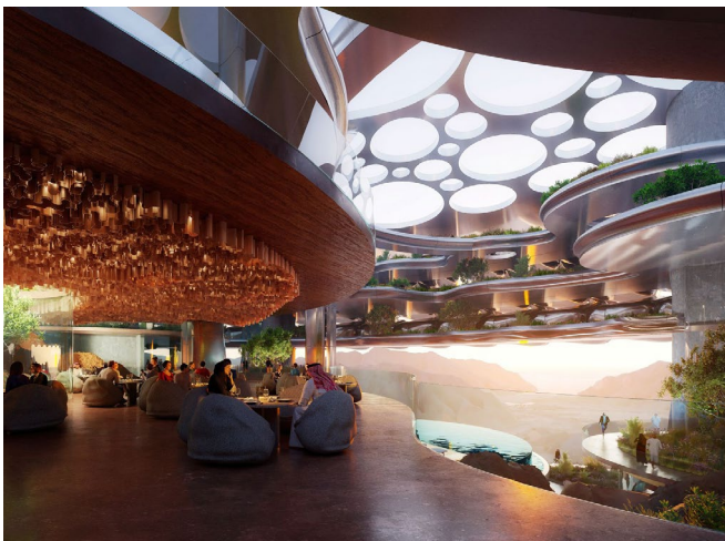
Trojena, NEOM (render)