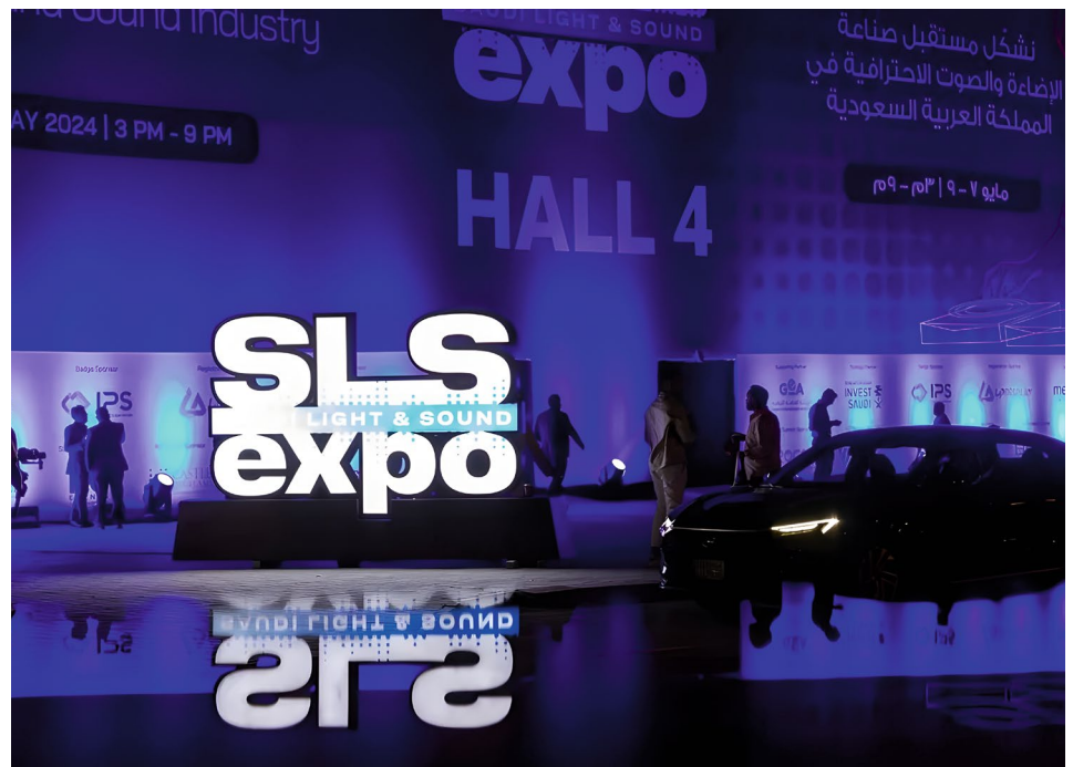
SLS Expo, RFECC

The meticulously crafted event ensures that every aspect finds its place, offering you the chance to forge valuable connections and elevate your business to unprecedented levels. Immerse yourself in the world of professional light and sound, leaving your indelible mark on the industry.